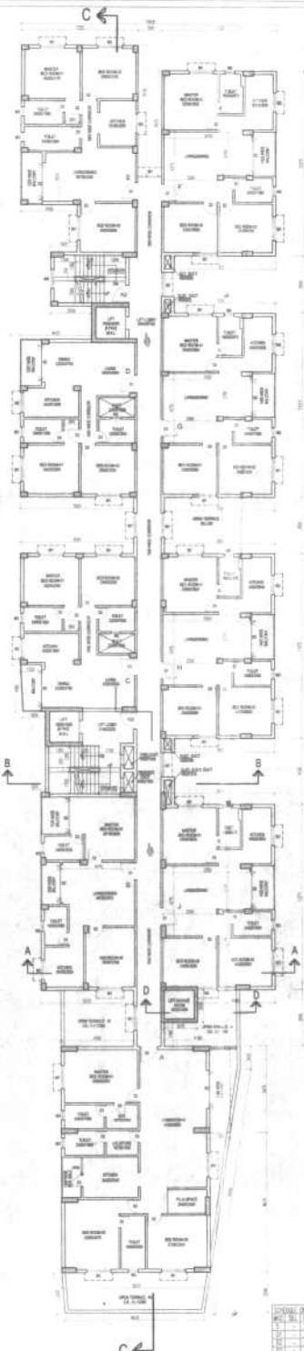
4TH FLOOR PLAN SCALE - 1:100